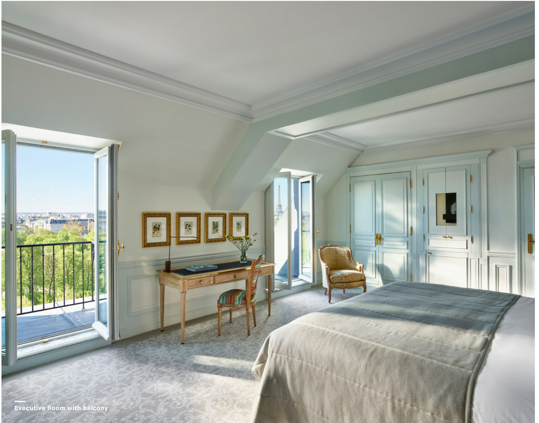
Executive Room with balcony