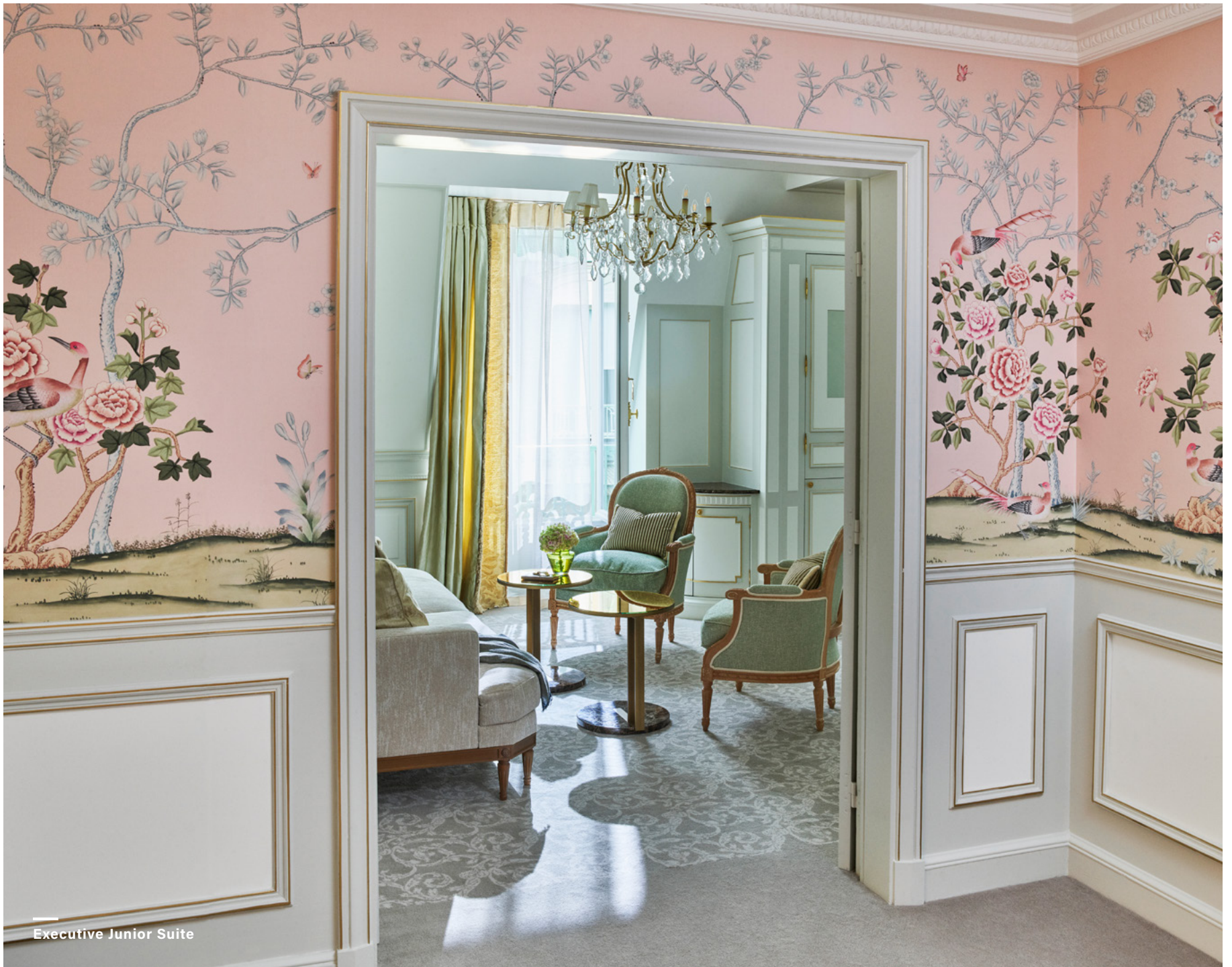
Executive Junior Suite