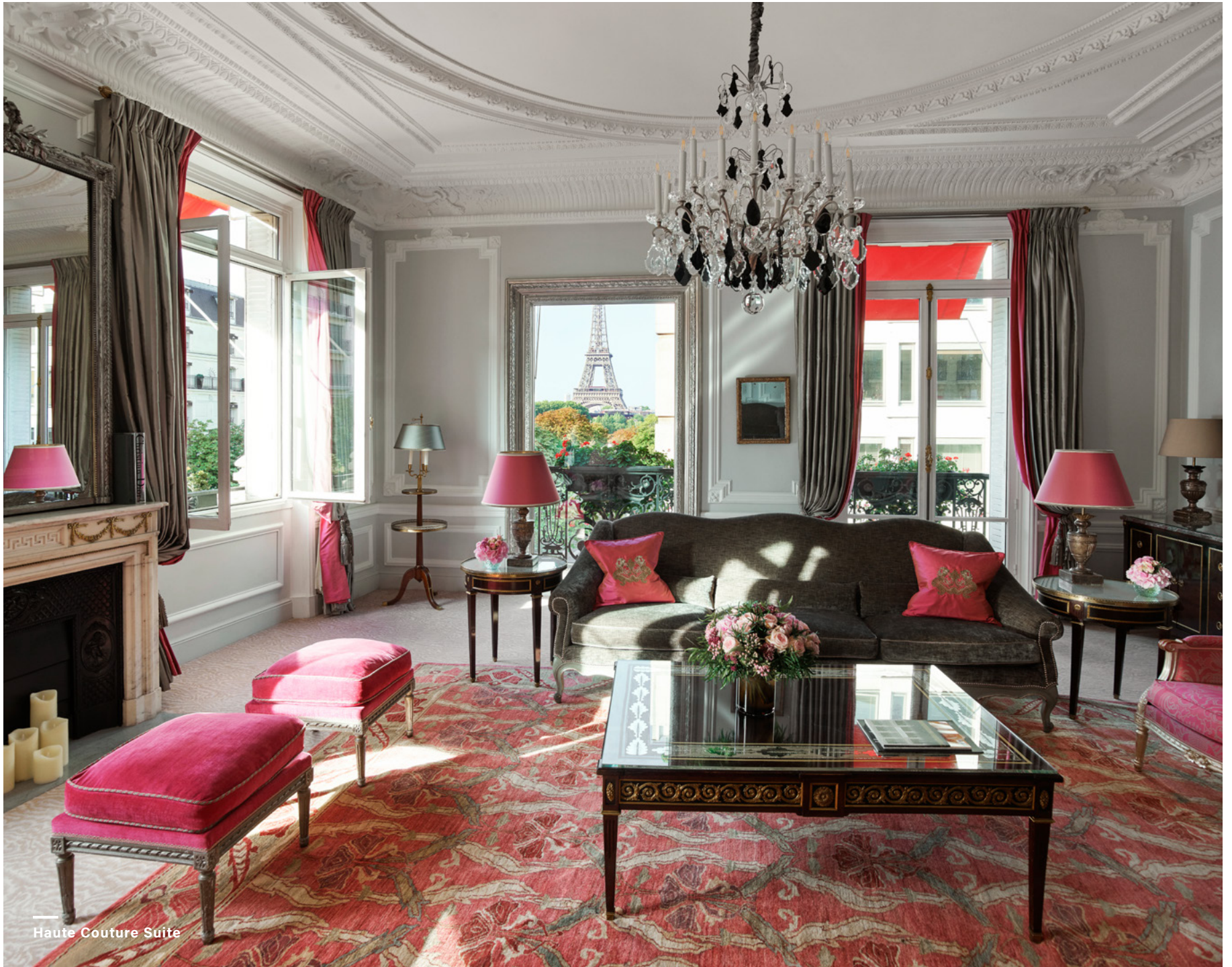
Haute Couture Suite