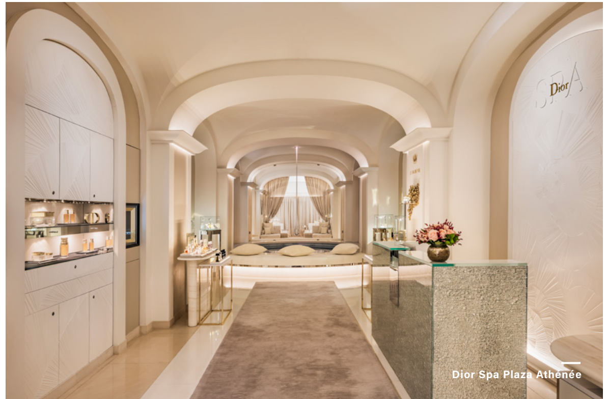
Dior Spa Plaza Athénée

The spirit of Haute Couture lives on in every personalised, hand-tailored detail of this suite. High ceilings grace every room, while a breathtaking view of the Eiffel Tower is framed by the tall living room windows.