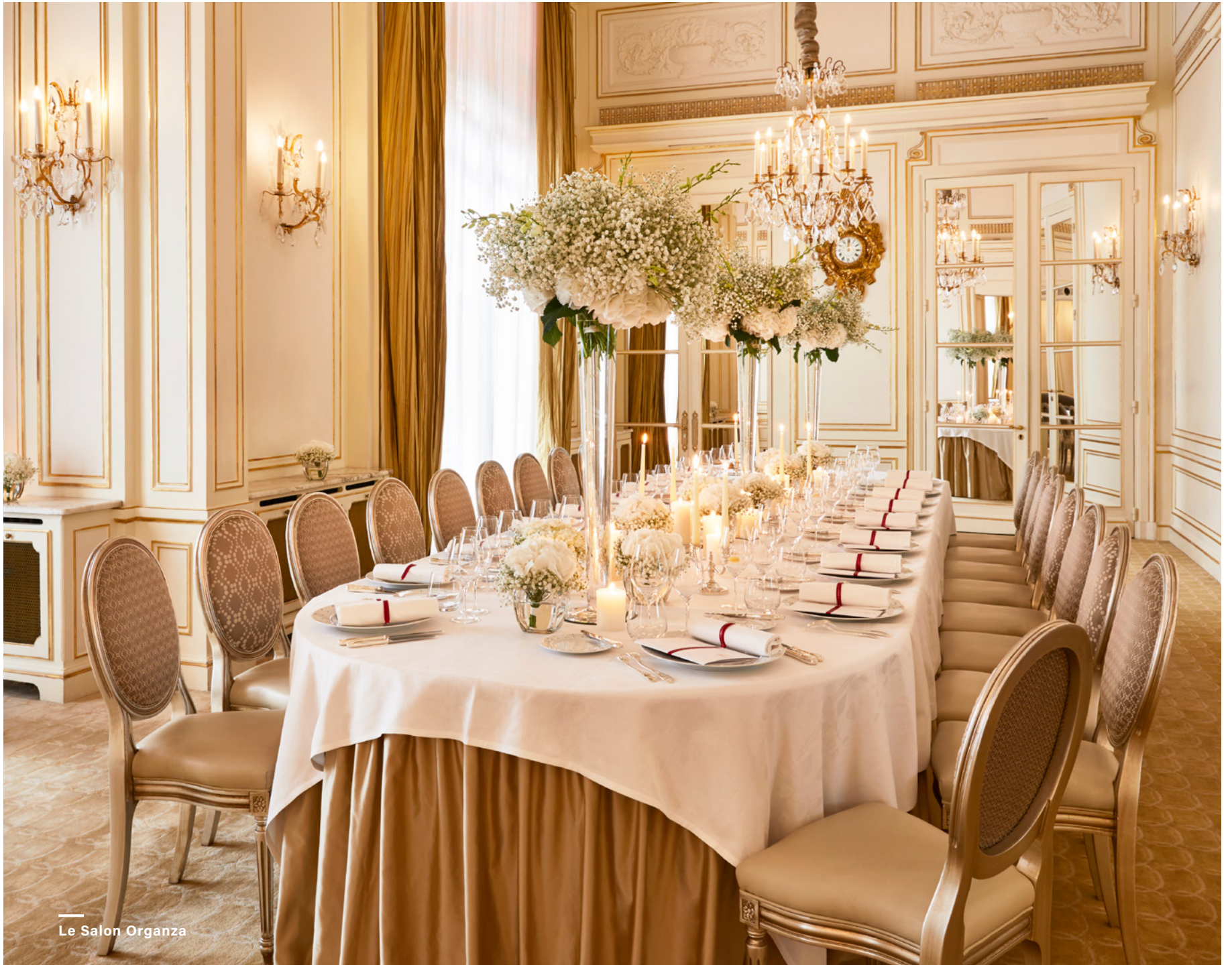
Le Salon Organza